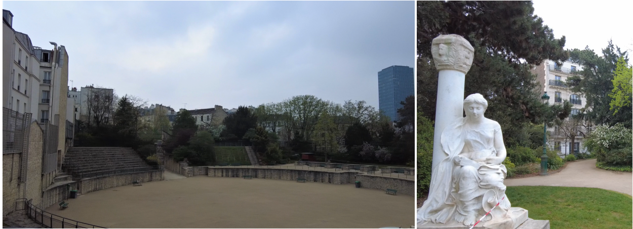
Arènes de Lutèce

If not, walk along Rue Daubenton with the mosque on your right and take the first right onto Rue George Desplas past the entrance to the mosque. At the end of the road, turn left onto Rue Lacépède and then first right onto Rue de Navarre which takes you up to the Roman amphitheatre - Arènes de Lutèce (7).