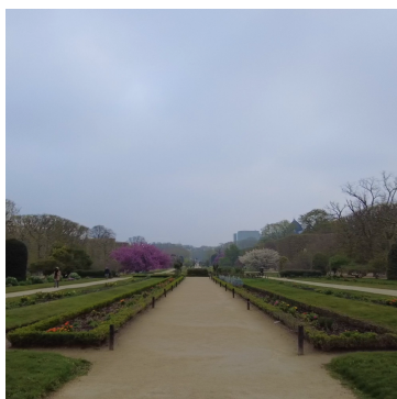
Jardin des Plantes

Walk to the top of the park which is dominated by the Grande Galerie de l'Évolution (4). As you leave by the exit to the left of the Galerie, you'll see a white building (or series of buildings) with an Arabic feel. It's the Grand Mosque (6) and the bit closest to you is the restaurant (5) if you're feeling peckish.