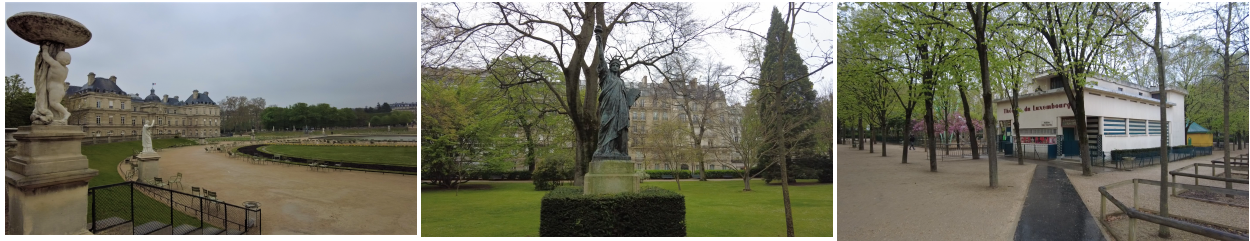
Jardin de Luxembourg

This leads all the way to the Luxembourg Gardens (9) which is now home to the Senate, the Luxembourg Museum , Orangery, a replica Statue of Liberty and a puppet theatre .